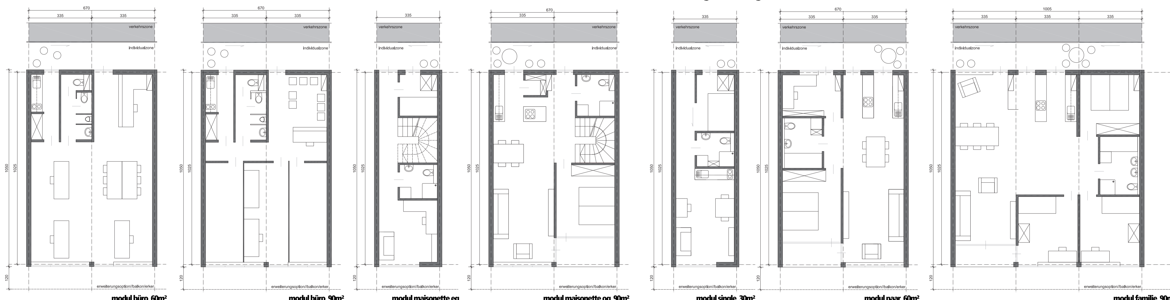
modul büro 60m 2