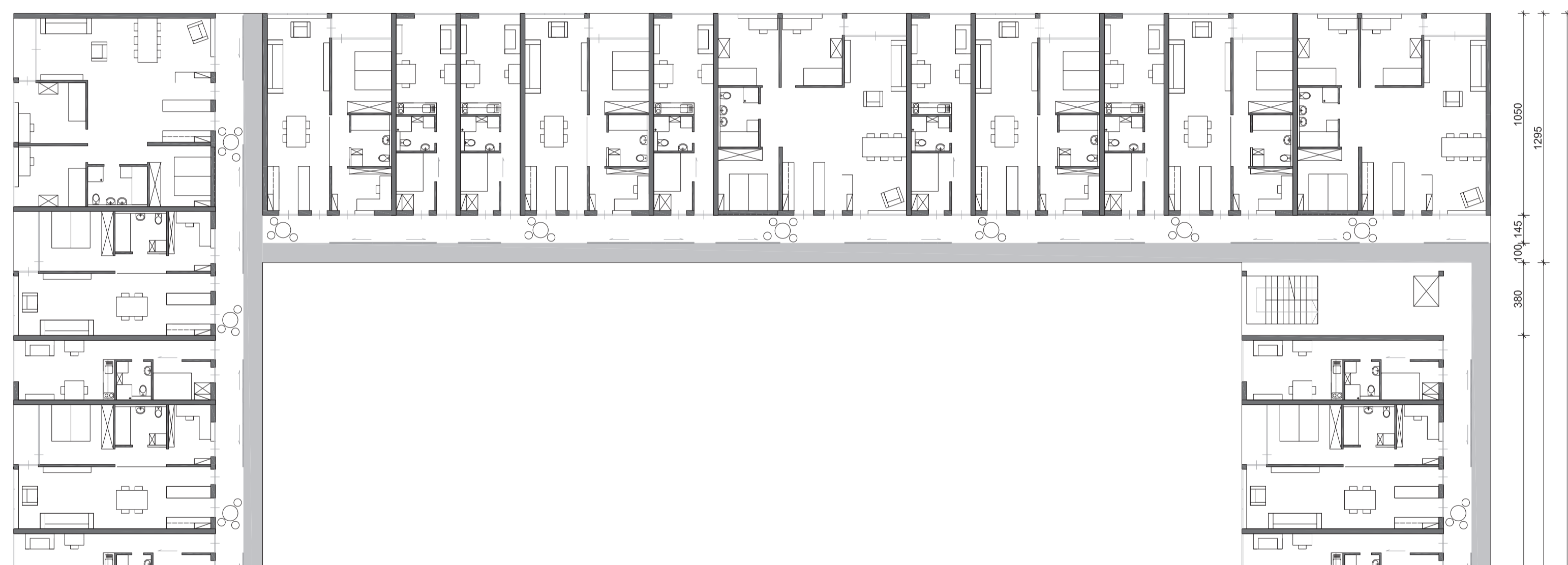
ausschnitt grundriss og 1:200